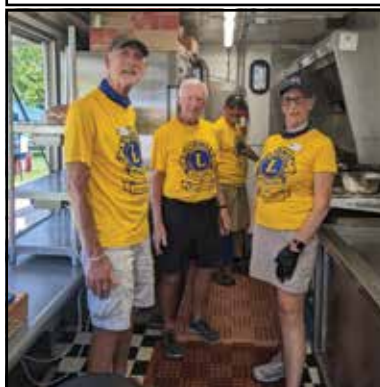
Photo: Cooks and servers in the Food Trailer at Arts in the Park

* Prices based on limited times, with no set-up charge for yearly purchase.